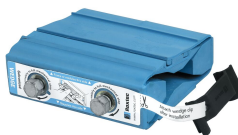
wedge og wedgekit